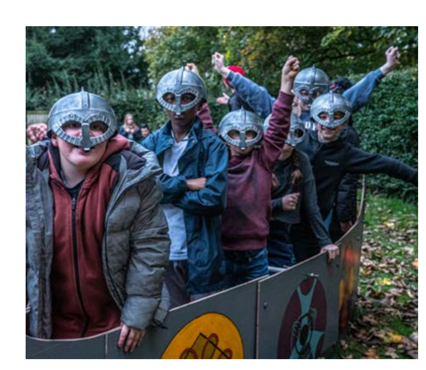
Heritage / historical