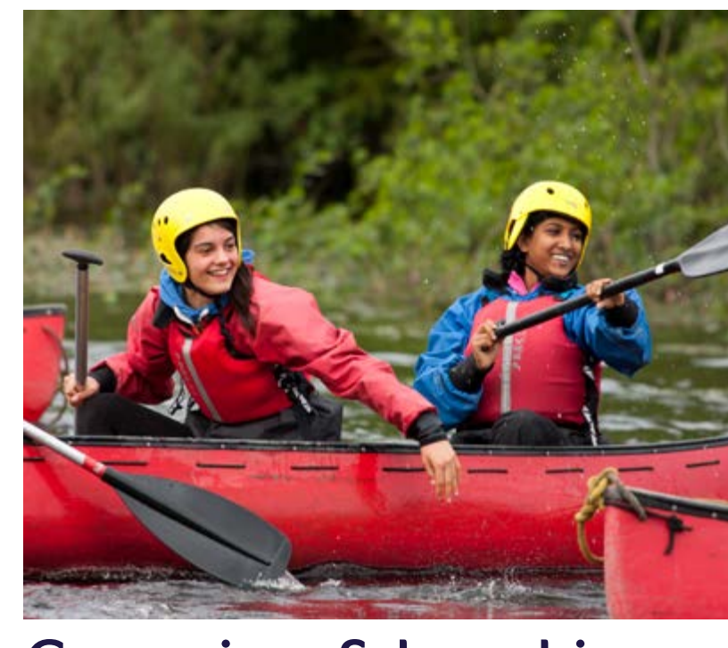
Canoeing & kayaking