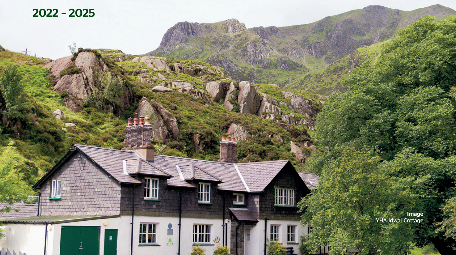
Image YHA Idwal Cottage