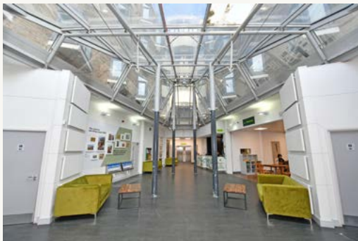
Public toilets in the lobby on the ground floor.

With level access from the lobby there are three public toilets. One of the toilets is fully accessible, fitted with grab rails, low level washbasin with lever tap and an emergency cord. The transfer in this toilet is right-handed.