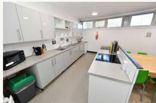
Self-catering kitchen worktops.