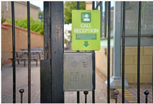
Security gate and intercom/buzzer.