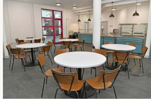
Dining room lower level seating layout and counter.