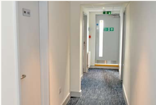
Fire exits on every floor.