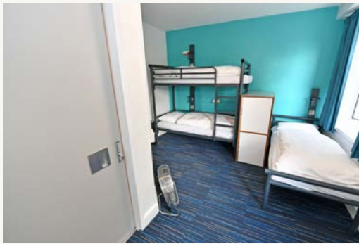
Accessible en-suite bedroom.