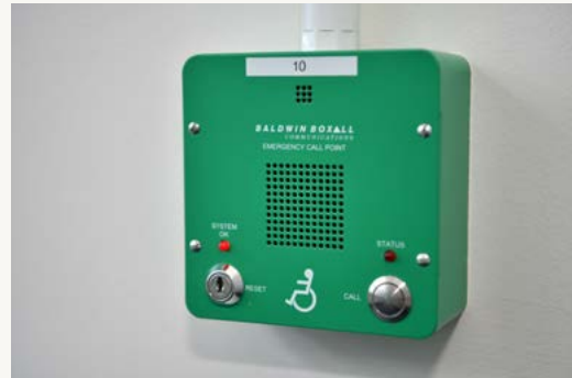
Refuge points with intercoms to reception on every level.