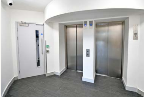
Accessible lift serving all floors.

The hostel has an evac chair and staff are trained to help guests evacuate in the event of an emergency.