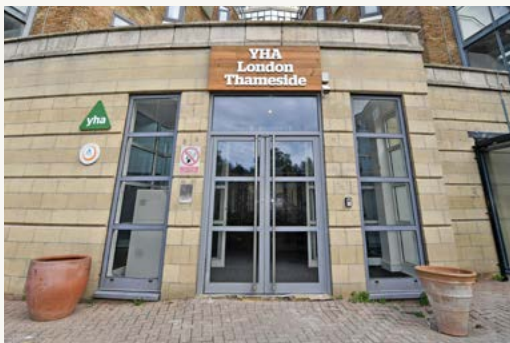
Entrance door with intercom/buzzer system.

Doors lead into our large, open lobby which is lit by a combination of natural light and ceiling lights. The lobby and reception area are level throughout a vinyl flooring. The reception desk is 112cm high. Seating is provided in this area with sofas, as well as tables and chairs in the café area. WiFi is available throughout the building.