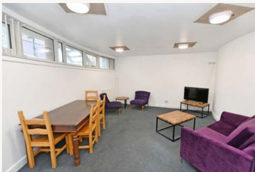
Lounge area on the basement level.

Here we have a large dining table with 8 chairs, a two-seater sofa, 2 armchairs and 2 coffee tables. All furniture can be moved, please just ask at reception if you require assistance.