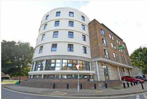
View of YHA London Thameside from Rotherhithe Street looking west.

YHA London Thameside is situated between Greenwich and Tower Bridge. Canary Wharf and the Docklands are nearby. The hostel offers accommodation close to London's main attractions but without the hustle and bustle of the city.