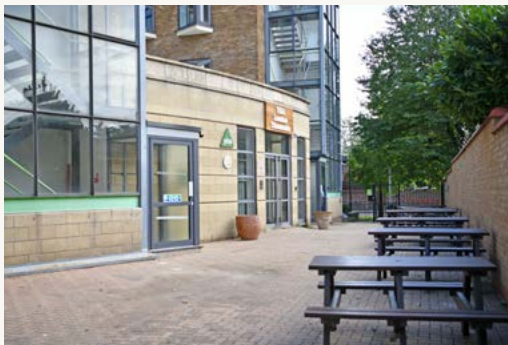
Courtyard area in front of the hostel.

Our courtyard area to the front of the hostel provides a secure space for guests to relax. There are 6 recycled plastic picnic tables and benches are available here. We do not have a garden but there is a park close by. There is no cycle storage at the hostel.