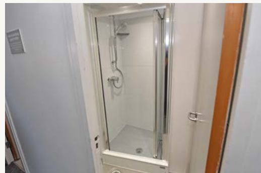
Standard en-suite shower.