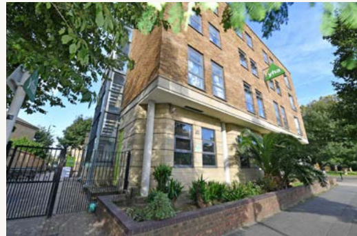
View of YHA London Thameside from Salter Road looking north.