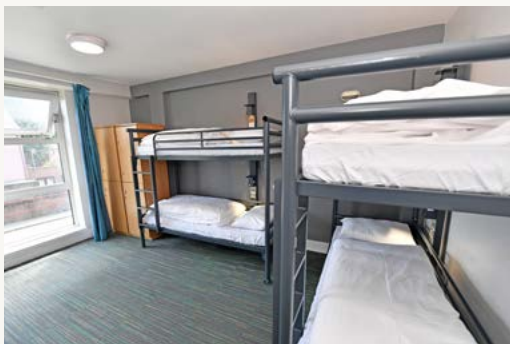
Bunk beds in a standard bedroom.

All of the en-suite bathrooms have fluorescent lighting and non-slip flooring. The standard showers have a step up to enter.