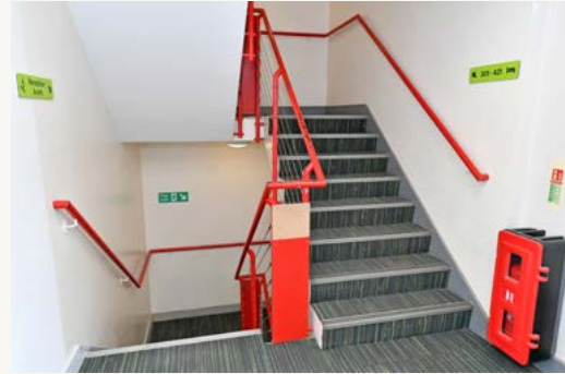
Carpeted staircases with non-slip nosing and a handrail on either side.