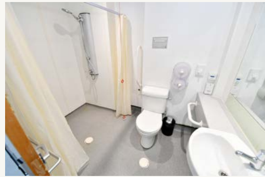
Accessible toilet and wheel-in shower.