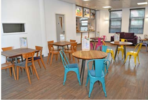
Café bar entrance area and bar.

There are tables and chairs that are well spaced, and which can all be moved. We would be happy to assist with this. There are also 2 two-seater sofas and 2 armchairs.