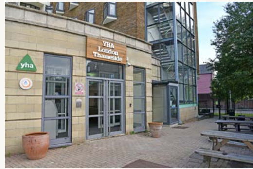
Level courtyard leading to the main entrance.